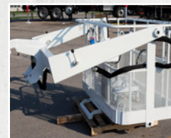
BOOMTRUCK WORK PLATFORM