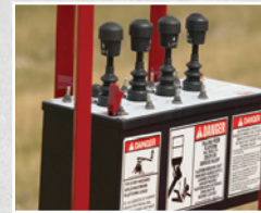
ELLIOTT DYNASMOOTH CONTROLS