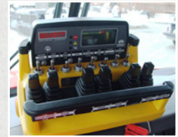
WIRELESS REMOTE CONTROLS