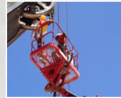
HYDRAULIC WORK PLATFORM

Visit www.elliottequip.com to find a dealer in your area for pricing, availability, rentals, financing and more. Contact Elliott directly at sales@elliottequip.com or (402) 592-4500.