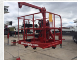
HI-REACH JIB WINCH