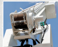
HI-REACH BOOM WINCH